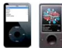
MP3 Players Audio & Video