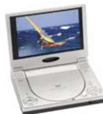
Portable DVD Players