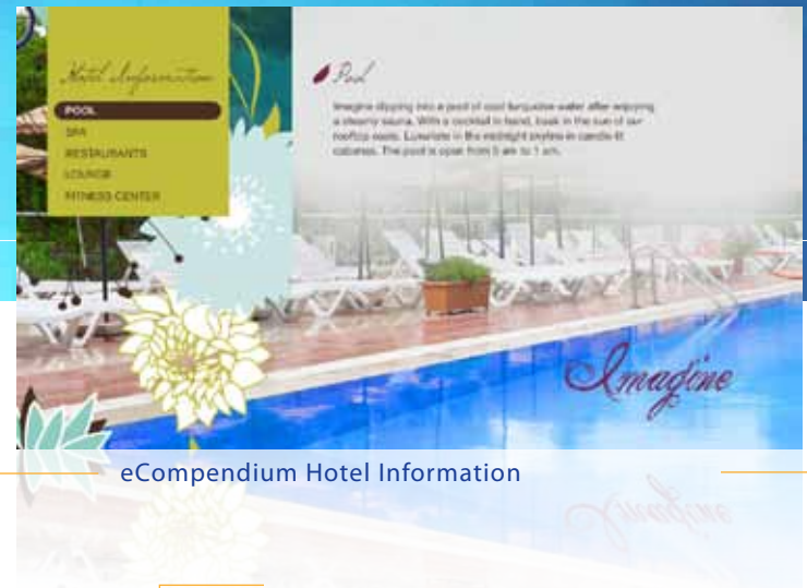
eCompendium Hotel Information

eBranding / Scale Envision across all of your properties. The potential to add apps for reservations, vacation club bookings, hotel-branded retail items or virtually anything you can imagine – the options are all yours!