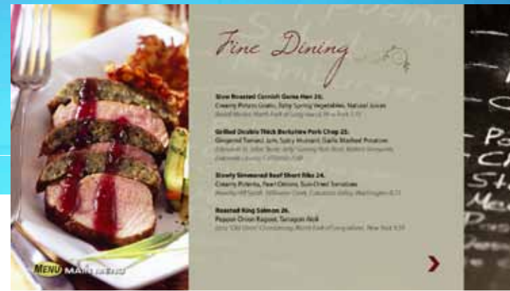
eCompendium Restaurant App