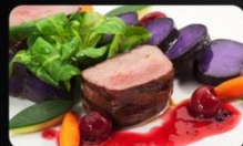
CHEF MARSEE'S GRILL 000 - 123 - 4567

Your Reservations are confirmed for: June 16, Thursday, 7 PM, Party of 4