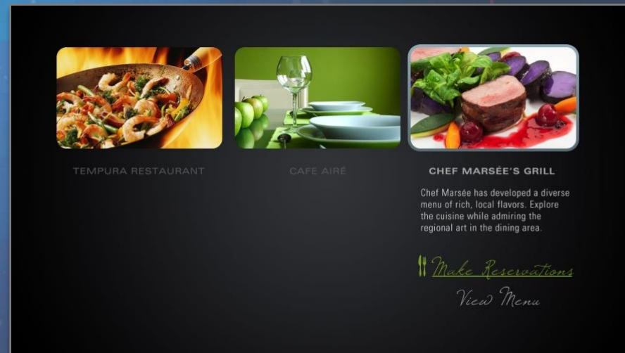
Restaurant Reservations App