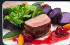
CHEF MARSEE'S GRILL

Enjoy a crisp and casual lunch at Cafe Airé. Fresh food and divine flavors await you near the turquoise waters of our dining patio.